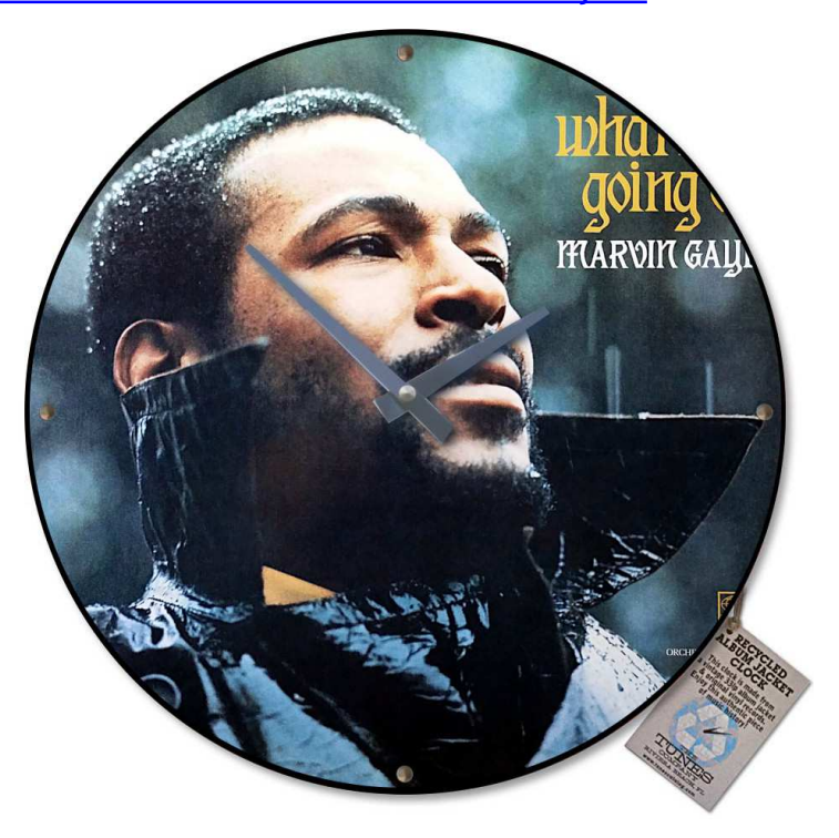
Get Marvin Gaye's What's Going On as a beautiful wall clock from Tunes Company! https://www.tunesco.com/