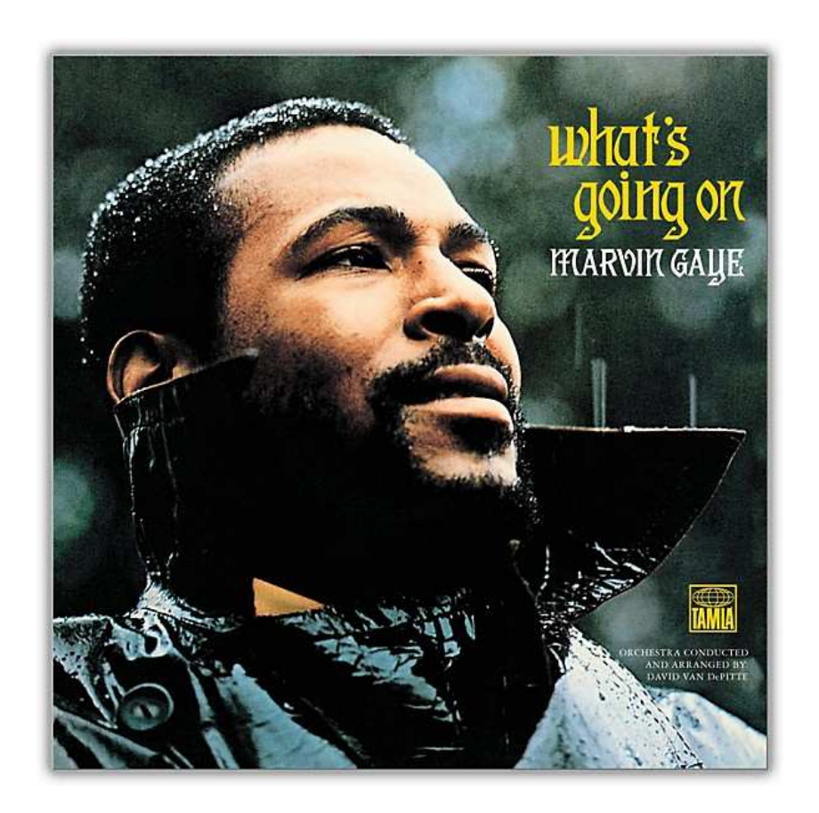
"What's Going On" - Marvin Gaye (1971)

https://www.youtube.com/watch?v=cFU-FJzPE80