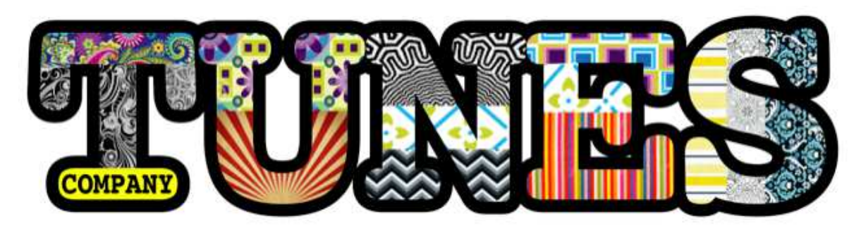
TUNES WEEKLY - Great Songs Of Brotherly Love! (Part Two)

Date: 3/19/2020, 9:42 AM To: evonleue@gmail.com