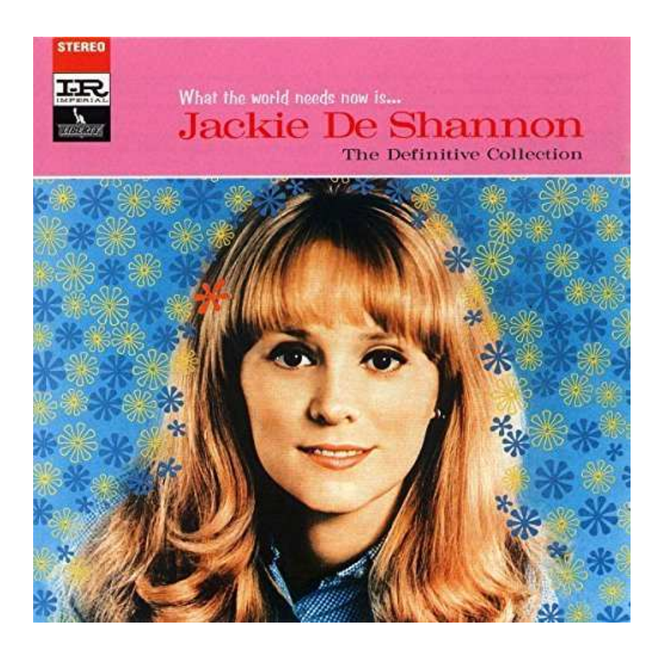
"What The World Needs Now" - Jackie DeShannon (1965)

https://www.youtube.com/watch?v= R2RsP43rmg