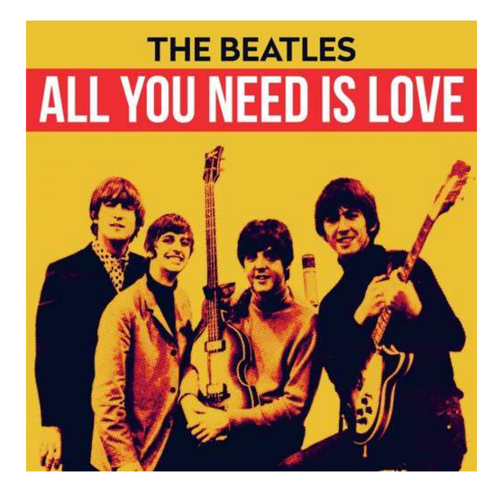
"All You Need Is Love" - The Beatles (1967)

All you need is love All you need is love All you need is love, love Love is all you need